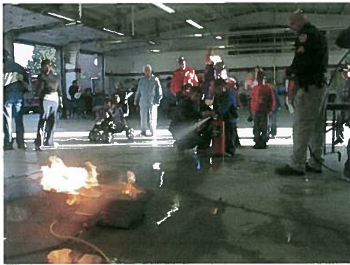
Fire Extinguisher Practice