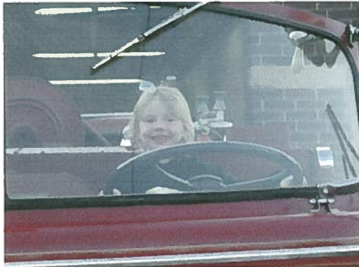
Fire Apparatus Display