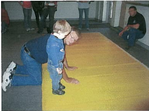
Stop / Drop / Roll