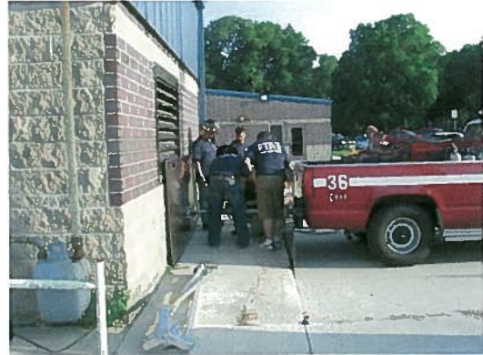
Trench Rescue Equipment