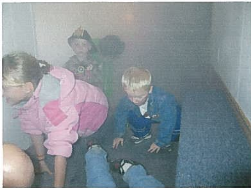
Stay Low and Crawl