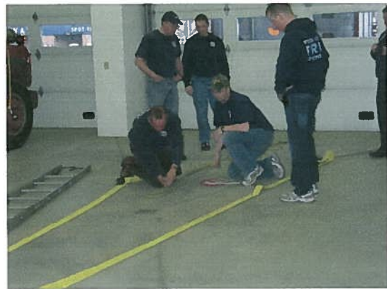
Ropes & Knots