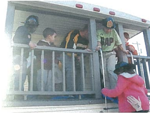
Using Fire Escapes