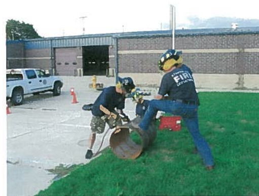
Air Chisel Cut