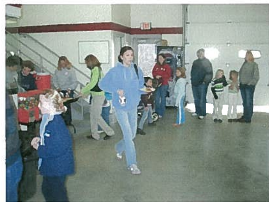
Free Hot Dogs & Chips Lunch