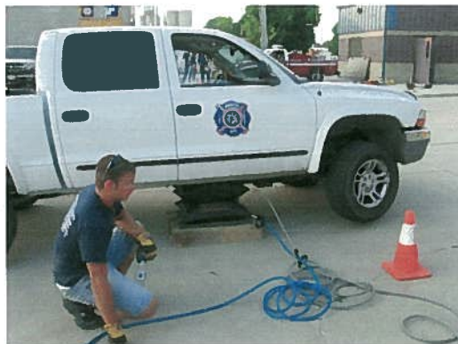
Air Bags Vehicle Lift