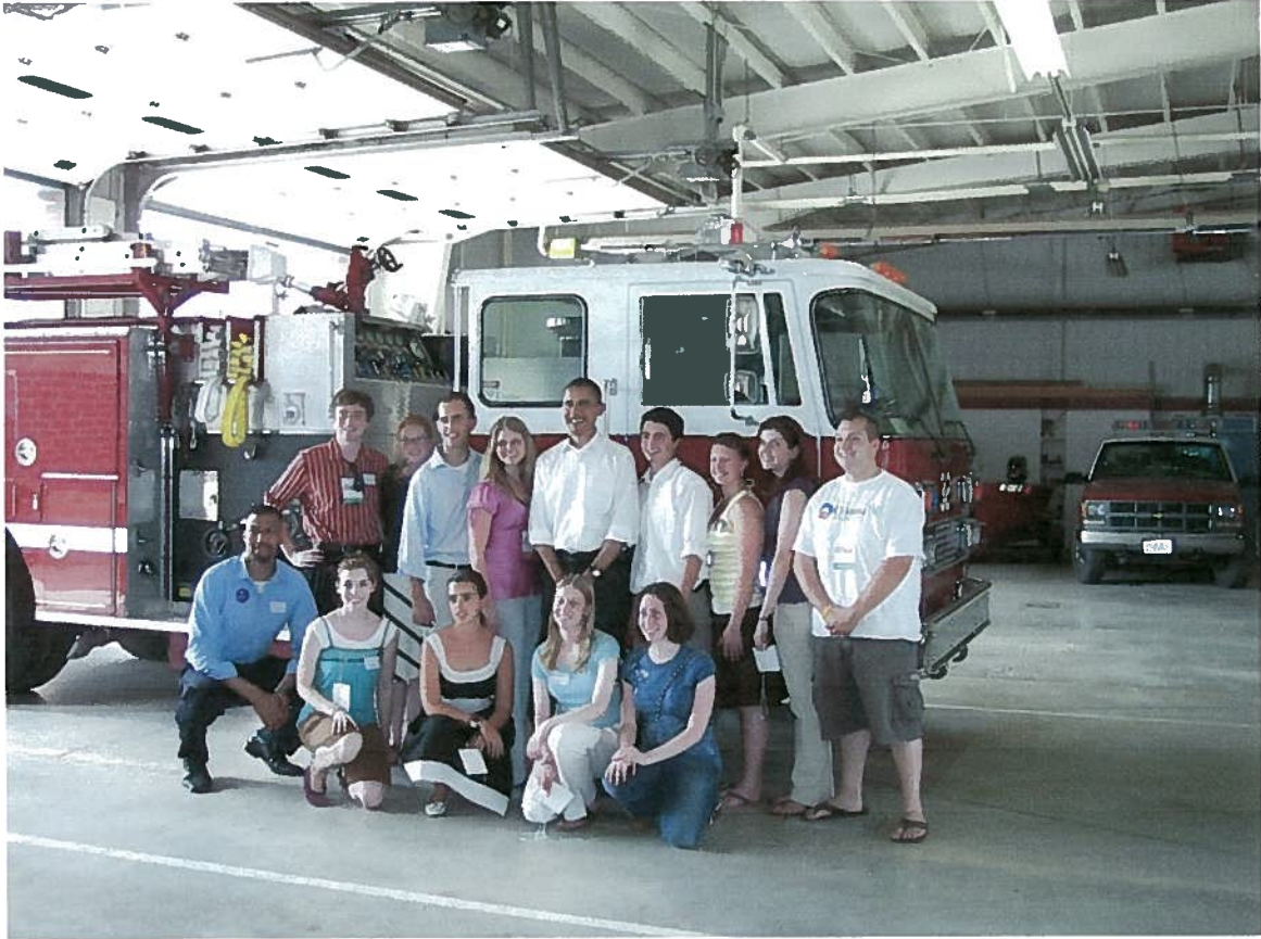
Picture taken 6/16/07 when then Senator Obama and staff was starting his presidential campaign.