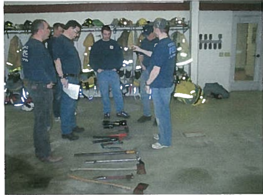
Forcible Entry Tools