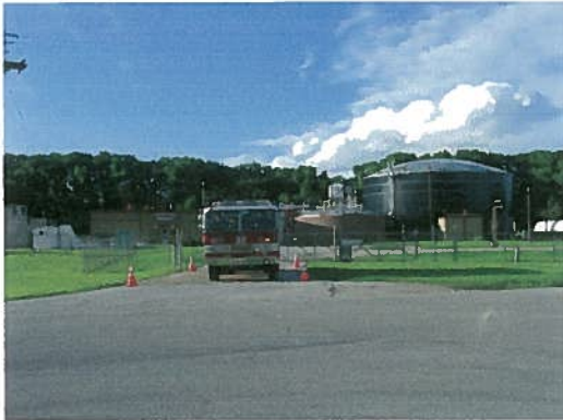
Driving Course – Backing into a Dock