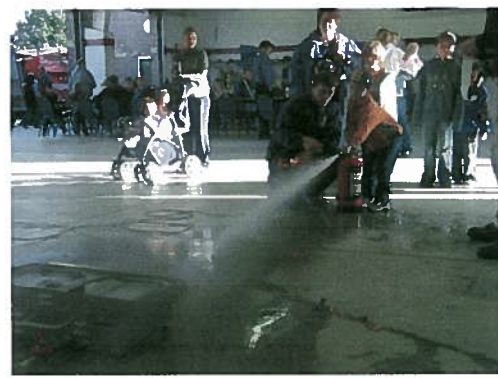
Fire Extinguisher Practice