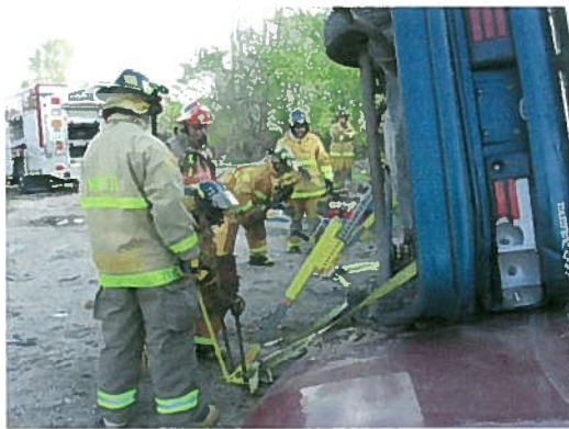
Vehicle Stabilization Practice