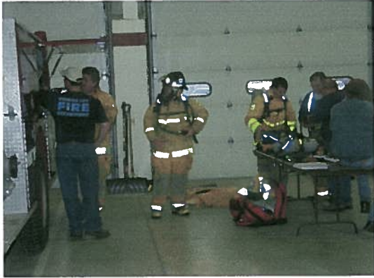
SCBA Donning Procedures