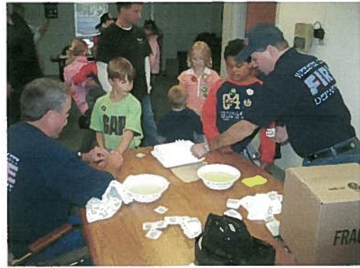
Fire Prevention Tattoos