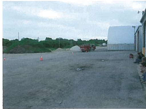
Serpentine – Forward, Backwards