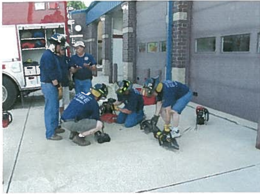
Small Engine Practice