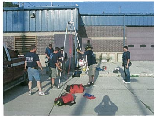
Confined Space Equipment