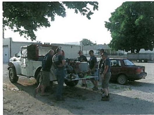
Portable Pump Operation